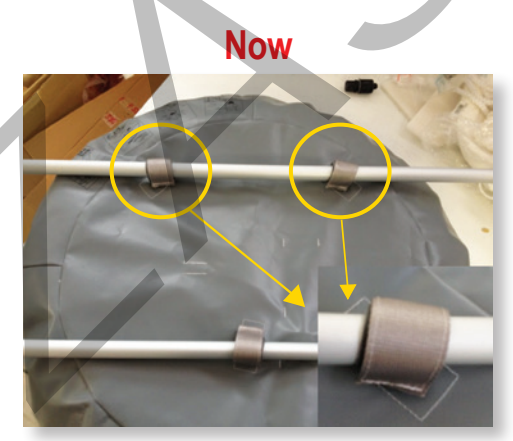
Longer Velcro patches, which will roll all around the rail for greater bonding strength.

2. Male Velcro was shorter than female Velcro.