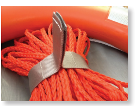
Equally long male and female velcro patches to maximise retaining strength of the 30m floating rope.