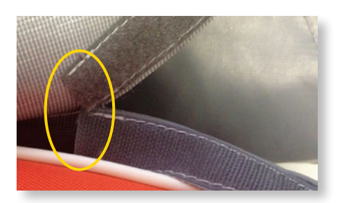
3. Open/Close case stitches on the Velcros.